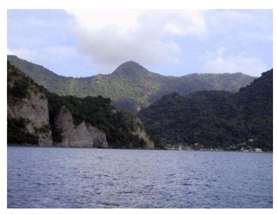
Carib-Indian community. San Juan, Puerto Rico

Largely rural, uncrowded and unspoiled, Dominica touts itself as a 'non-tourist destination' for divers, hikers and naturalists – partly because it lacks those white-sand beaches so favored by holidaymakers to the Caribbean. The island's main attractions involve strapping on some gear and working up a sweat, making it a great destination if your interests extend beyond lying motionless in the sun.